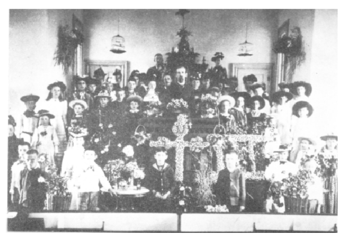
Children's Day Concert in the Universalist Meeting House in 1888. Does anyone know why bird cages with live birds were hung in the sanctuary?