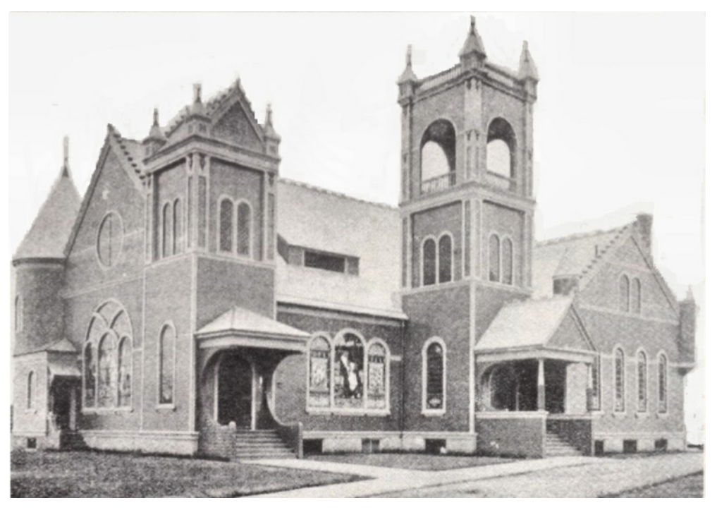
The new building in 1901, two years after completion. The old Meeting House turned 90° is seen on the far right. An olive color, it was a very modern church building.